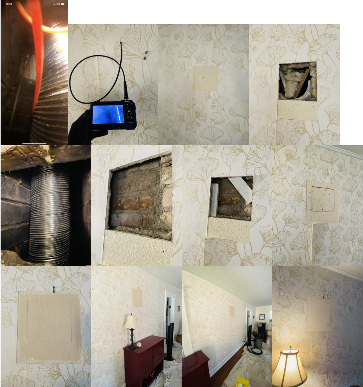
Location of the unsealed thimble. Sealing of the thimble. Replacement of the sheetrock, mudding... customer said they are planning on doing a smear texture down the road. For now the picture will hang back up and cover the spot on the wall. The base of it pulled out a little from the wall as it dried (not visible in the photo).