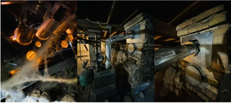
Furnace test fire and venting upon completion. CO test showed 000ppm.