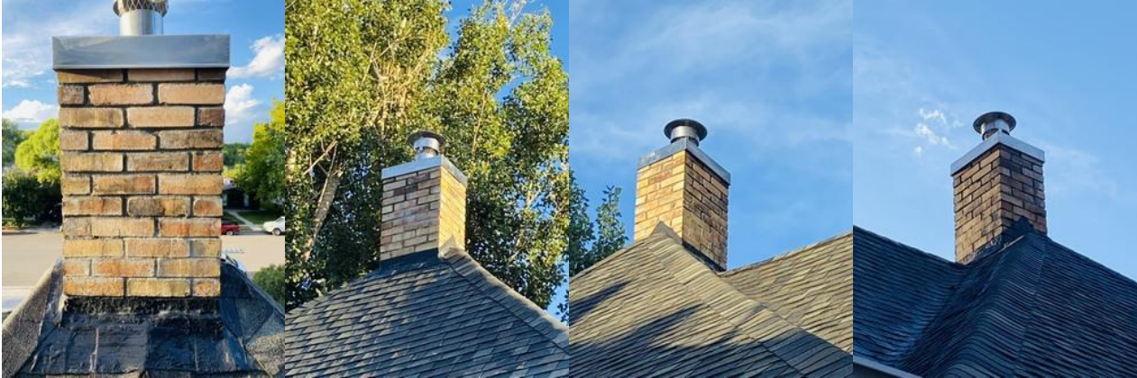
Completed chimney rebuild as visible from the ground up.